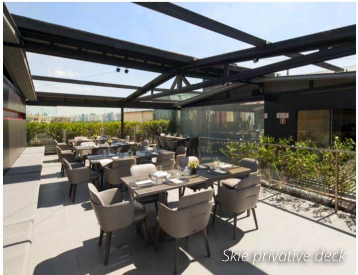
Skye private deck

+55 11 3055-4732 skye@hotelunique.com Instagram @hotelunique www.hotelunique.com